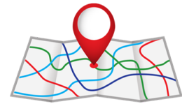
UBICACIÓN DEL RESORT