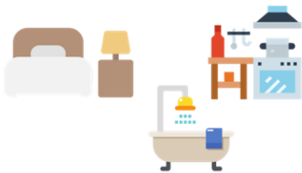
TIPO DE UNIDAD

3 factores que determinan el monto de Pago por Unidad: